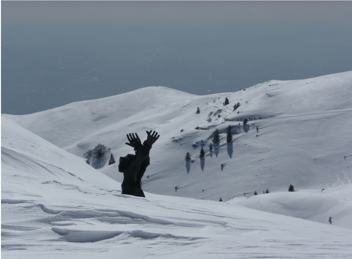
Monument to the Resistance on Cima Grappa. The bronze sculpture in the snow.

figure, Murer's partisan, in clear opposition to the multitude of columbaria in the fascist shrine. Along the different stages of its route, the monument to the Resistance creates a space for the reworking of a collective trauma by using ancient symbolic figures: two precincts linked by a door . The precinct has always been a sign that separates the sacred from the profane, the known from the unknown, the real from the unreal; it guarantees the recognition of a place and, by extension, it evokes a sense of security and salvation. The door , meanwhile, represents a single point of transition from one condition to another; its presence marks the passage from the profane to the sacred world, signifying discontinuity rather than contact between two connected worlds. These symbolic figures, set in the landscape of the Pre-Alps and designed to convey the dreadful horror of the mass-slaughter, encompass a rich layering of meanings. Beside the symbolic and narrative value, the sequence of the different spaces resonates with a strong emotional impact. The continuous change of perspective, the transition from narrow to wide spaces (path – first circle – fissure – second circle), the sudden passage from light to shade are all features which provoke a range of oppo-