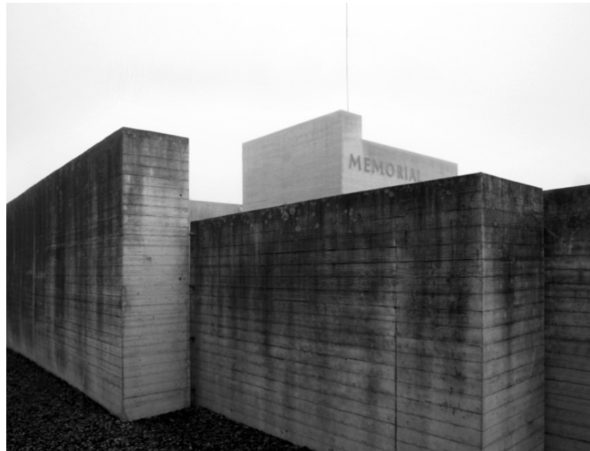
Monument to Roberto Sarfatti, Col D'Echele 1934-35 (by Giuseppe Terragni).