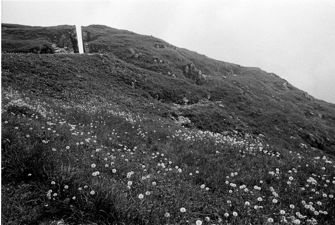
The fissure in the rock seen from a distance.

to defines the relationship between men and places: a necessary bond that lets an individual, or rather an inhabitant, consider himself as part of a much larger and sometimes unreachable whole. What opens up before the eyes is not a panorama, but the background that makes sense of the human actions in the foreground, semantically as important as the landscape behind the main subject in the interpretation of a fifteenth-century Italian painting. On the contrary, the nearby fascist shrine employs the mountaintop as a breath-taking location, well suited to represent the patriots' apotheosis. Yet, in both memorials the relationship with the landscape creates a sense of vertigo: a romantic vertigo in the shrine, where the vain effort of architecture to challenge nature inspires a sinister feeling of death; a historical vertigo in the terrace-theatre of the monument, where the individual, literally projected into the landscape's embrace, can perceive the flow of the events. Moving forward along the route, the path, now narrowed to 2 metres wide, continues for 30 metres between two concrete walls, like into a fissure in the rock. This space, which can be read as a door leading from a condition to another, encompasses multiple images: an evocation of the tunnel where the Partisans died; a metaphor for the wound dividing the country under the war; an