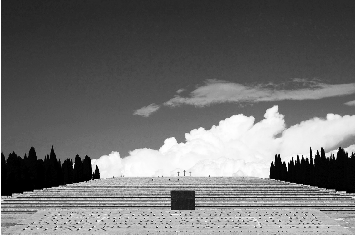
Military shrine of Redipuglia, 1935-38 (by Giovanni Greppi and Giannino Castiglioni).

morial should be a sign, a testimony, a scoria in the folds of the landscape. On the contrary, those sites crystallised at the time of the event, are likely to be disguised or trivialised, 14 since they are reduced to empty scenes, to sterile fiction. Only an obvious transformation, which amplifies the distance between the past and the present, can awake the evocative force inherent in sites of remembrance. In this task, a memorial works just like memory does: by re-reading the reality (the site and the event) a memorial traces a modified order, where elisions and transfigurations help transmissible meanings to re-emerge and consolidate. In other words, a memorial can offer an experience of reworking and overcoming the past by virtue of a new topography, where memory can be triggered by enigmatic, not trivially explicit images. In this way, the transformed site is more distant, elusive, estranged, but this estrangement brings it closer to the truth. For James Hillman, places have a soul. This soul is memory, which can be evoked by ritual gestures: remembering the blood flowing in the ground; marking the boundaries between the Sacred and the Profane; gathering meanings; relying on the fragments of the past; finally, being able to see the Invisible. According to Hillman, the latter is the most important aspect of an architect's education ( "the awakening of the aesthetic response, the