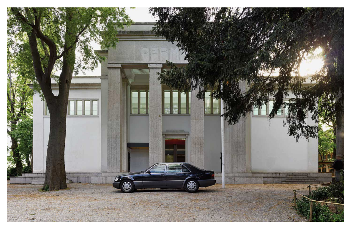
Fig. 3 Helmuth Kohl's car staged in front of the facade of the German Pavilion. Bungalow Germania. Alex Lehnerer and Savvas Ciriacidis.

stion our relation to a given object. Whereas intervention in a more conventional understanding has had an affirmative aim in seeking to uphold a certain meaning reserved for an object, the experimental approach intervenes in order to test the interpretive boundaries for an object, sometimes to the extent of collapse of meaning<sup>12</sup>. Within this understanding preservation becomes a practice that uses intervention in order to explore the illusory aspects of heritage and to question it as a self-explanatory given. Unlike textual and discourse analytical critique of this, the experimental preservationist uses physical intervention as a way of touching the realm of experience as a route to question architecture as testimony. Consequently, the experimental paradigm uses intervention not from an objective of care and maintenance but to play with boundaries, modification, re-contextualization and contrasting. It is in this way that the architectural montage can be seen not only as artistic practice but as part of an interventionist tool of experimental preservation practice.