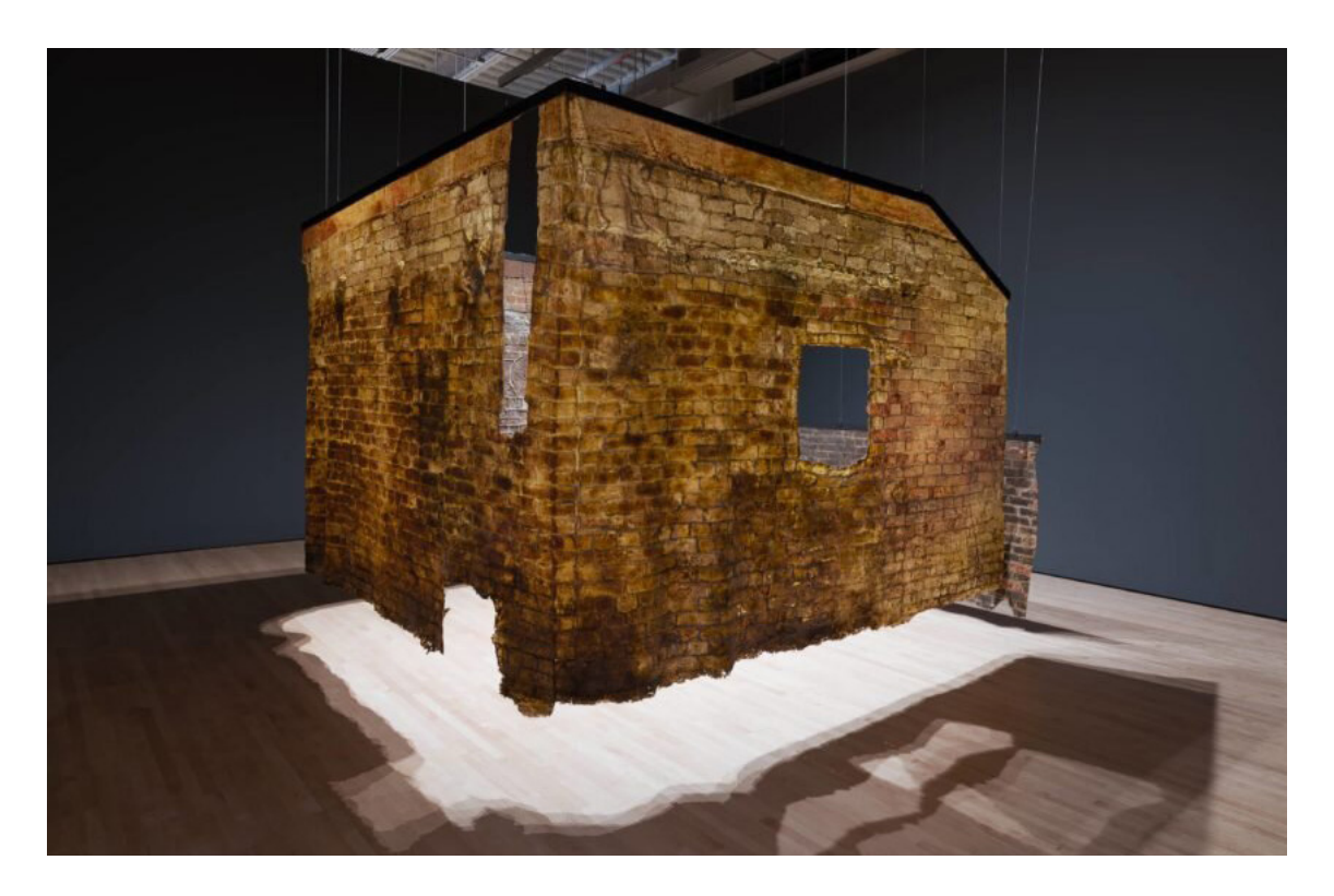
Fig. 1 Pollution as cultural heritage. Latex cast of more than one-hundred years of accumulated pollution on a chimney of the Old United States Mint, questioning our expectations to what the notion of heritage can contain. Artwork from the series Ethics of Dust by Jorge Otero Pailos. © 2021 Studio Otero-Pailos.

fragment to come forth as a quality in and of itself within preservation, a reinterpretation of two fundamentals of this field is useful: how preservation defines its object and its tool of intervention.