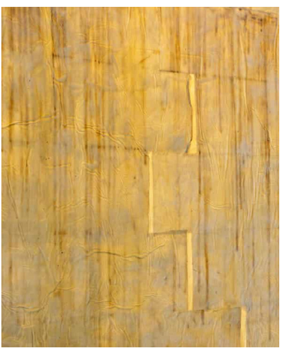
Fig. 2 Ethics of Dust by Jorge Otero Pailos. © 2021 Studio Otero-Pailos.

A common understanding might be that preservationists work on objects already intrinsically defined as heritage. This has long positioned the preservationist as technical doers possessing the expert knowledge necessary to practice the care and respect required towards the heritage object. Whereas the experimental preservationist might choose objects that are already canonical or enrolled in what Laurajane Smith has termed the