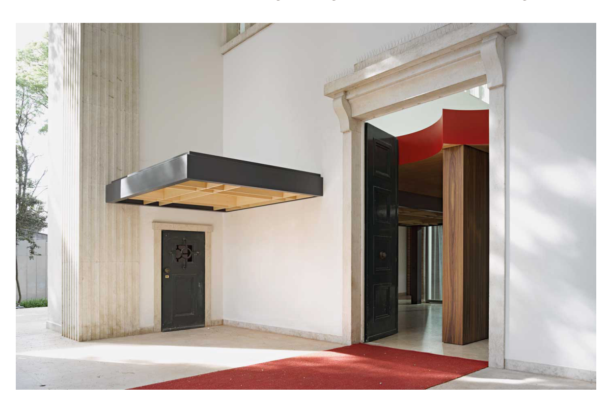
Fig. 6 Bungalow Germania. Alex Lehnerer and Savvas Ciriacidis.

Montage in its three-dimensional form here intertwines the grand narratives of 20th century German and European ideologies with the intimate experience of their spaces. Montage is here an experimental preservationist intervention in so far as preservation should also care for the continuous and unsolvable intellectual labour that having a heritage comes with. Representational space is not entirely dissolved but the overlap of chronologies and narratives brings about a shift from what the buildings represent to the gesture of reading them itself. In the form of the fragment architectural heritage in this case comes forth as an existential condition, more than something to be chosen or discarded of. Despite a lean aesthetics of wood and stone the installation points at the porous nature of the relation between materiality and meaning. If the "Ter-